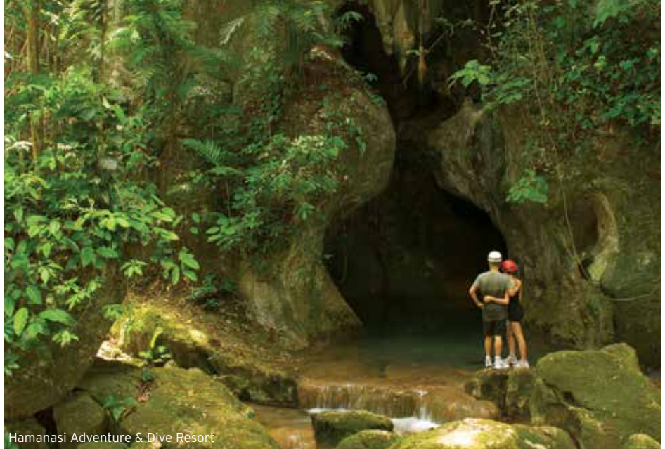
Hamanas Adventure & Dive Resort

New this year to Oasis Sens, in addition to