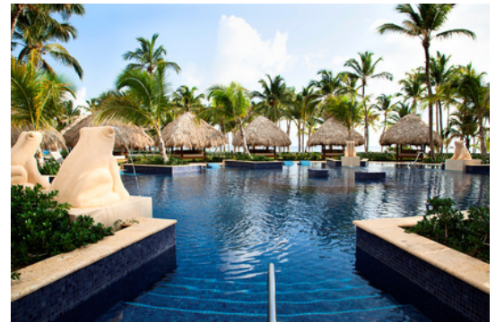
The Barcelo Bavaro Beach Resort is an extraordinary tropical getaway. (http://www.worldpropertyjournal.com/news-assets/The-Barcelo-Bavaro-Beach-Resort-is-an-extraordinary-tropical-getaway.jpg)