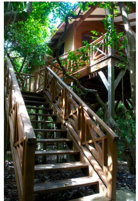
Ensconce yourself in a luxurious tree house at Hamanasi Resort.

of tourists, lies the Hamanasi Adventure & Dive Resort. Here, you can spend your Caribbean getaway in luxurious tree houses or serene oceanfront rooms. You can dive among Belize's color-splashed reefs, trek through the rain forest, or climb the pyramids once climbed by the ancient Maya. Or, you can take a romantic hike to Mayflower Waterfall, or an exciting kayaking trip on a river through the heart of the jungle. Wherever you go, though, you'll see exotic ecosystems teeming with wildlife.