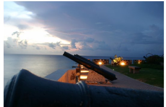
At the Hilton Barbados, you can walk into history!

BARBADOS - The Hilton Barbados Resort is known for traditional "Bajan" hospitality, and a location second to none. It fronts two of the most beautiful beaches on the island, where the sands are pure-white and the waters are crystal-clear (making for great diving). This hotel was built on the site of 17th-Century Fort Charles, another UNESCO World Heritage Site. Unlike many old forts, though, Fort Charles is still here...and its cannons and walls can be explored without leaving the hotel grounds! The 350 rooms and suites in the Hilton offer breathtaking ocean views. The Lighthouse Terrace Restaurant has real Caribbean cuisine accompanied by classic Caribbean rums. And the resort's only a few miles from the colorful capital city of Bridgetown.