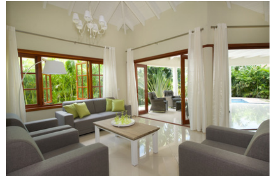
Lakefront villas at Acoya Curacao bring the outside in.

The Dutch Caribbean is a truly unique region, bringing the flavor of the Old World to the tropics of the New World. Here you'll find the Acoya Curacao, a new property featuring luxurious villas with private pools, in a serene setting with excellent dining and proximity to (and free transportation) the popular Mambo Beach. The resort's also close to the Dutch architecture and classic old buildings in the capital city of Willemstad, a UNESCO World Heritage site. And also nearby are golf, tennis, hiking (there are forty picturesque hiking trails through mountains, hills, and meadows), and even yoga.