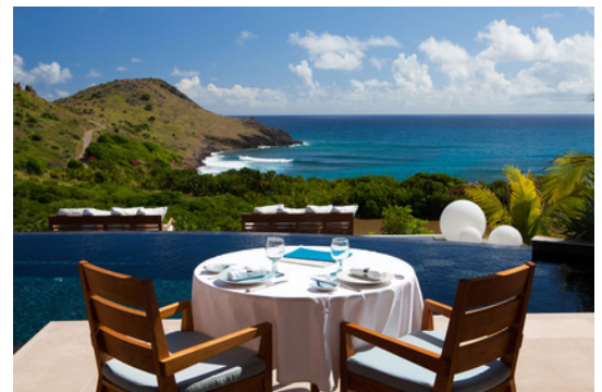
Hotel Le Toiny resort, St. Barts (http://www.worldpropertyjournal.com/news-assets/Hotel-Le-Toiny-resort--St-Barts.jpg)

HOTEL LE TOINY, ST. BARTS - At Hotel Le Toiny, 15 pastel-colored Villa Suites reflect the island's French Colonial style. Private and discreet, this boutique retreat sits on 38 acres on the Island's southeastern side, with each suite overlooking an island lagoon and the Caribbean Sea, and offering a kitchenette, large terrace and private heated swimming pool. The French ambience is enhanced by the meals at Restaurant Le Gaïac, featuring innovative combinations of Classic French and island flavors. You can work off the meals at the new fitness center or the Serenity Spa. Le Toiny attracts a discriminating crowd that prefers seclusion rather than sensationalism, and that appreciate the Continental touches. And the Continental touches come naturally. St. Barts - measuring just nine square miles