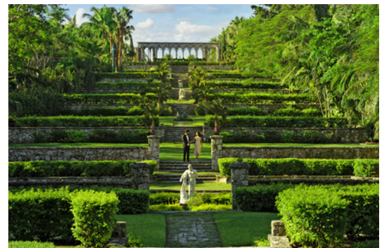
Terraced Gardens at the One&Only Ocean Club.

tricky crosswinds will make you work for your birdies. Afterwards you can enjoy the renowned cuisine of Chef Jean-Georges Vongerichten.