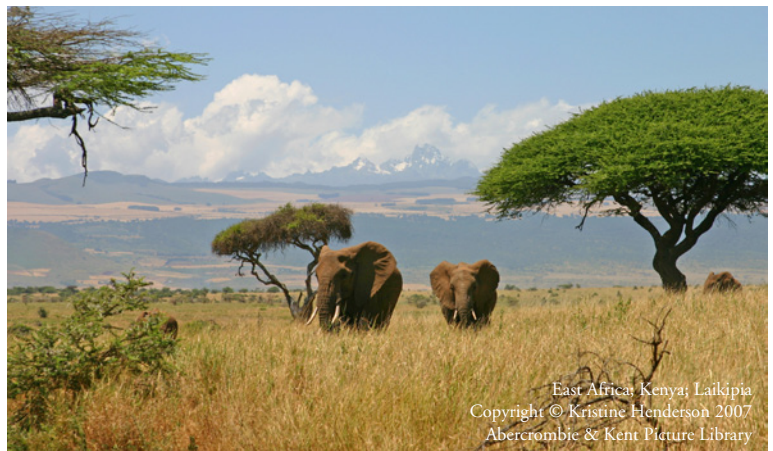
East Africa; Kenya; Laikipia

An African Safari offers a once-in-a-lifetime, memorable experience. What better way to start your journey as husband and wife!