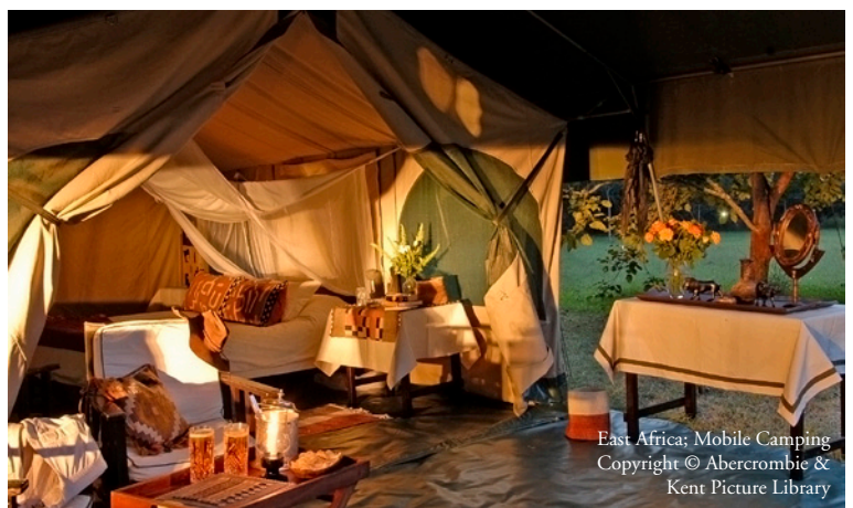
East Africa; Mobile Camping