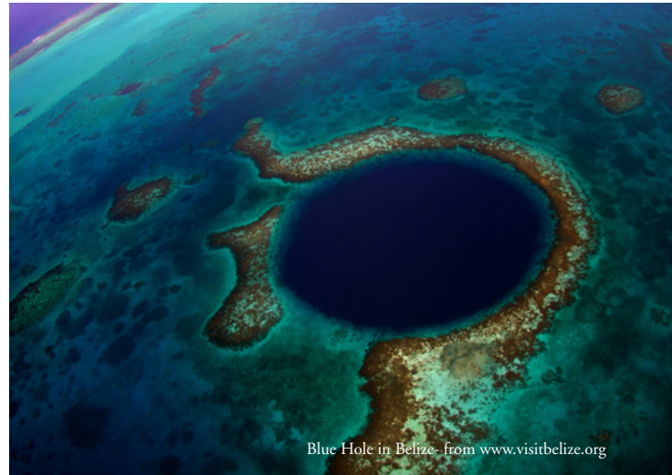
Blue Hole in Belize.. from www.visitbelize.org