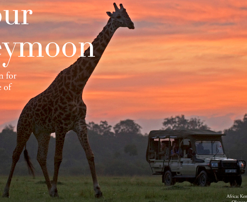
Africa; Kenya; Masai Mara; Sanctuary Olonana; Guests on a sunrise game drive viewing a giraffe bull

If you and your fiancé are adventure lovers who enjoy escaping to the great outdoors and prefer seeing wildlife rather than living the wild life ... an adventure honeymoon may be just what you crave.