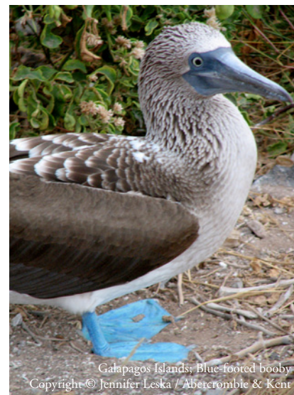
Galapagos Islands; Blue-footed booby