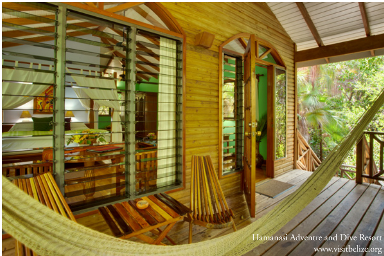
Hamanasi Adventure and Dive Resort www.visitbelize.org

And don't forget an underwater camera or waterproof camera case for snorkeling, scuba diving or even on rainy days.