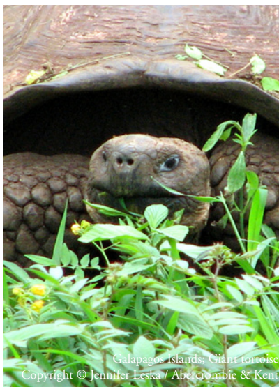
Galapagos Islands; Giant tortoise

From the dramatic sunsets to moonlit cruises, the remote and exotic setting of the Galapagos will inspire romance. *