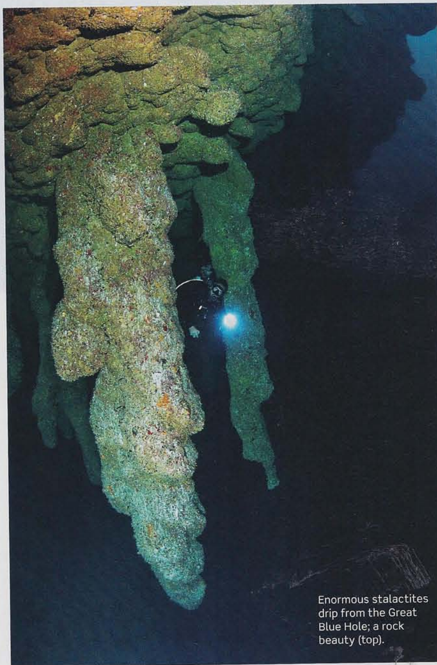
Enormous stalactites drip from the Great Blue Hole; a rock beauty (top).