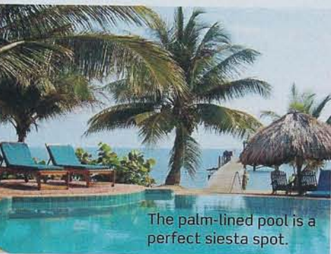
The palm-lined pool is a perfect siesta spot.

501-520-7073, 877-552-3483 or info@hamanski.com