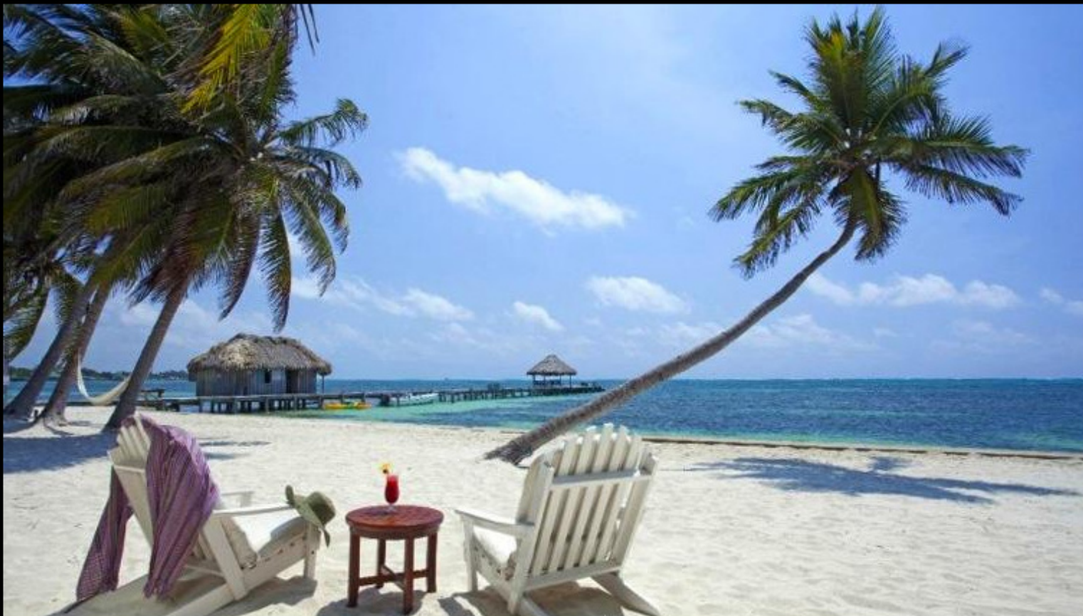
1 of 11 BELIZE • The only ice you'll see on the island of Belize is in your cocktail, which you'll nurse beachside, basking in the warmth of the Caribbean sun. • STAY: Hamanasi Adventure & Dive Resort, Hopkins Village, Belize less